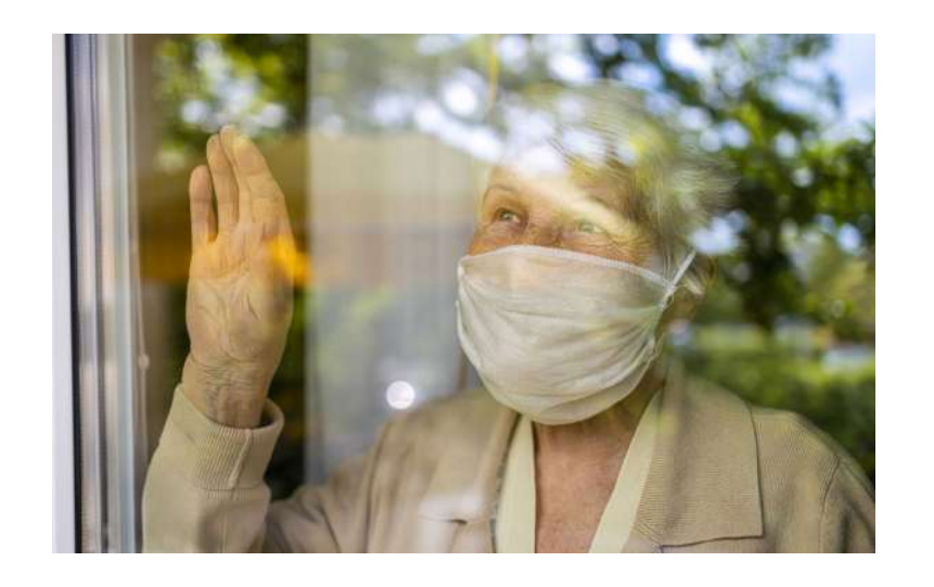
Friday - Fantastic Friday

Overall, we have enjoyed staying in touch with families via video calls, window visits, and garden visits.